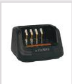
MCU Rapid-Rate Charger CH10A07