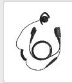
Swivel Earset EHN17