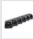
MCU Multi-unit Charger (for Thick Battery) MCA08