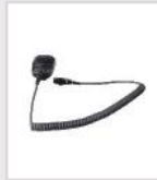
Remote Speaker Microphone (IP57) SM18N2