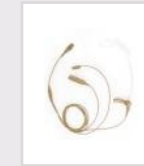
3-Wire Surveillance Earpiece with Transparent Acoustic Tube (Beige) EAN17

Pictures above are for reference only and may vary from actual products.