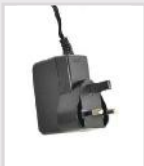
Universal Standard Switching Power Adapter PS1044