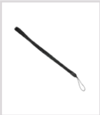
Belt Clip BC19