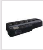
Battery Optimizing System MCA05