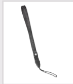
RO04 - Leather Wrist Strap