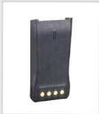
Lithium-Ion Battery (2000mAh) BL2016