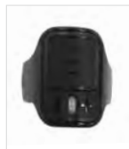
Wireless Finger PTT