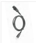
Programming Cable (USB Port)